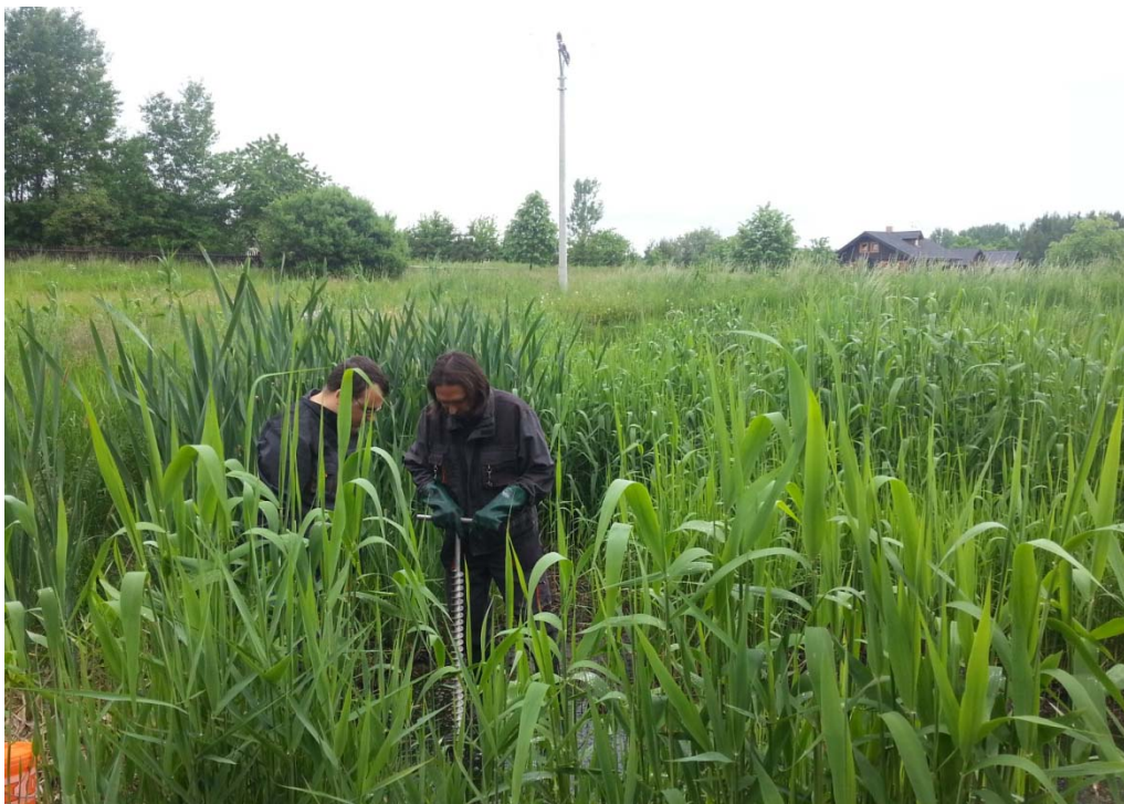
Sampling of gravel of clogged inflow zone of the root wastewater treatment plant