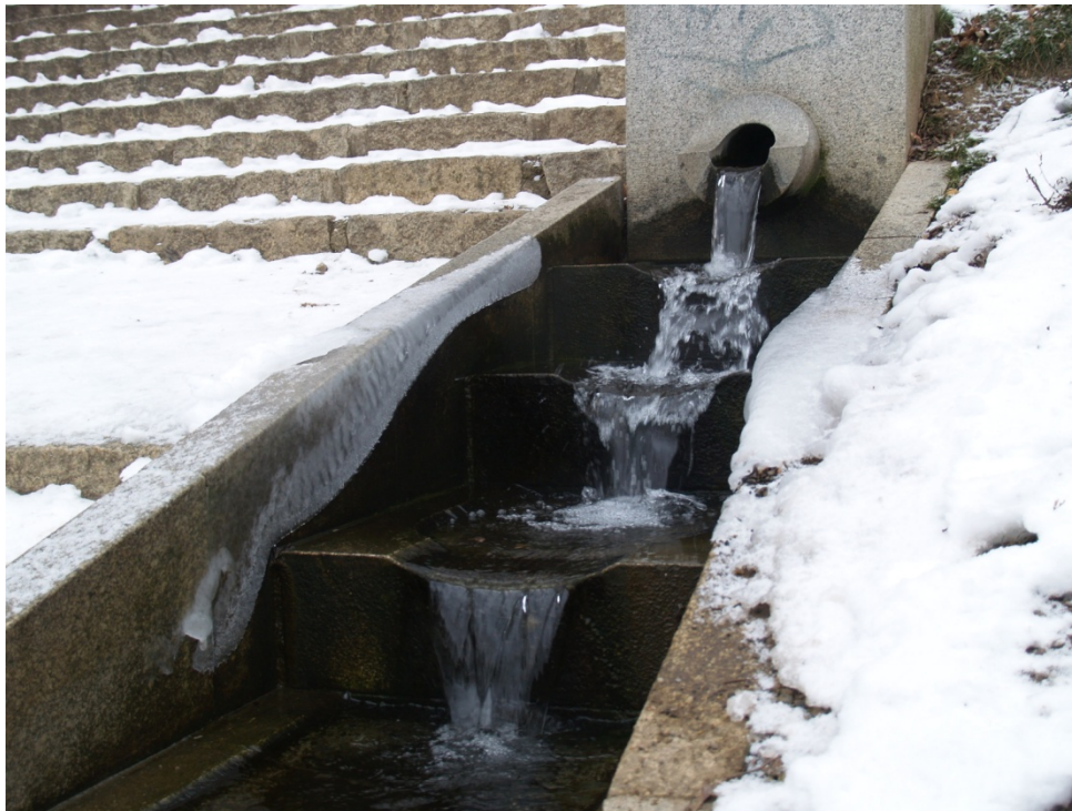
U Jezírka Spring, Petřín, Praha

In the last project year, the certified methodology will be finished and approved. The title of the methodology is "Identification, registration, water quality monitoring and protection of alternative water resources in municipalities and securing of their usability in the case of emergencies and crisis situations". The Handbook for municipalities will be finished.